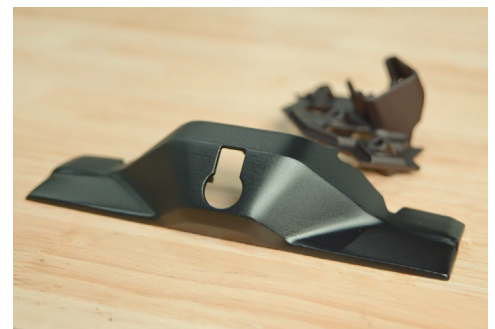
The 3D printed camera mount bracket with retention clip shown behind.

3D printing the camera mount resulted in at least a 50% cycle time reduction compared to injection molding, allowing Roush to meet its production schedule. The injection mold solution would have taken three to four months to get from the initial tool design to the final parts and cost approximately $30K. The cost to print the SAF parts was about $19.5K, for a 35% savings, and cycle time was cut to eight weeks. Additionally, a 3D printed prototype of the new mount design showed that it was not optimal. Roush was able to quickly 3D print a better design and print the final parts, avoiding additional delays and costs to rework a mold for the redesigned part.