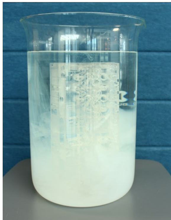
WSS™150 (water-soluble support) removal using tap water.

“Printing one of our small engine parts and using the water-soluble support has been a game changer for us.” Brian Tempest, Design Engineer – Tempest Tool & Machine, Inc. “We just left it overnight in a bucket of tap water and the part was 100% clean and clear of support. That speaks volumes for what that support material can do for us. It has completely changed what we can do as far as clean up. It’s really unbelievably simple. We’ve got a $5 bucket of tap water and it’s totally hands-off. We have not changed out the WSS support material in the J55 and are using it with all prints because it is so convenient. We have also tested the Stratasys L2S™ liquid to solid powder with a 10 gallon barrel and can report great success. It’s very simple to use and a great option.” Tempest can now stay ahead of the competition and continue providing their customers with high-quality products.