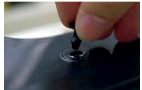
The operator uses pins to lock the part into place.