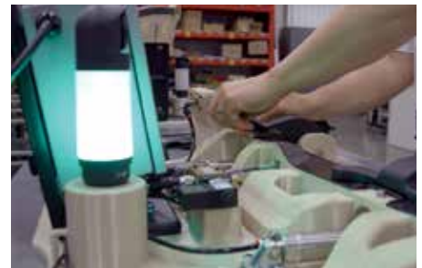
A green light confirms the pins are accurately locked into place and is a validated part.