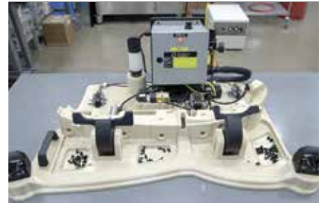
Automotive assembly jig built in ULTEM™ 9085 and FDM Nylon 12™ material.

Stratasys 3D printing technology enabled Solaxis to continuously improve the jig, saving the customer production time and money. In turn, the automotive supplier has significantly increased the reliability of the door seals it provides to its OEM customer. With zero compliance issues the last two years, that means higher profits for the company.