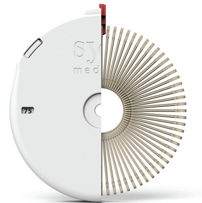
One of the cartridge designs used in the inhaler for dispensing the medication.

“One of the biggest design challenges was the inhalation system. Different patients inhale in different ways, different age groups have different lung volumes. So we needed to create an airflow system that is completely patient-agnostic. And we had to achieve this in an affordable and rapid time frame,” explained Perry. “In a single month we iterated 10 completely different flow mechanisms that we printed in house, culminating in a unique mechanism which solved the problem. This