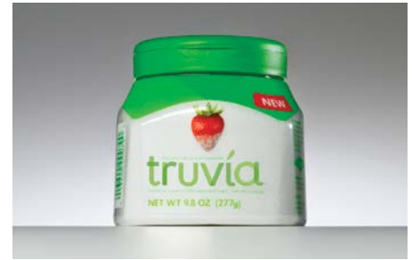
How Did FDM Compare to Traditional Prototyping Methods for Silgan Plastics?