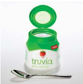
The Truvia package was designed to be attractive enough that consumers would want to display it on their countertop.

Silgan Plastics is a leader in the design and manufacture of plastic bottles, jars, tubes, caps and fitments for the food, health care, personal care and household markets. Silgan Plastics is an operating company of Silgan Holdings, a leading manufacturer of consumer goods packaging products with annual net sales of $3.1 billion in 2010.