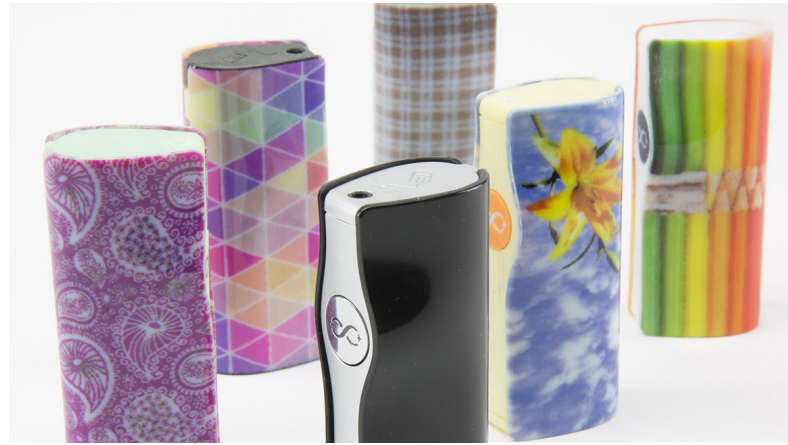
This mobile phone charger sleeve was prototyped with many image options.

Before the Stratasys J750, Prototyping Manager Omer Gassner would have tapped several vendors to create a single keypad panel prototype — using CNC machining and water printing for the body, casting for the light pipes, sanding for smoothness and then silicone engraving and additional printing for the buttons. This process would have taken anywhere from ten days to two weeks to create, at a cost of $700 per unit. With the Stratasys J750, it took just hours and cost $200 per unit.