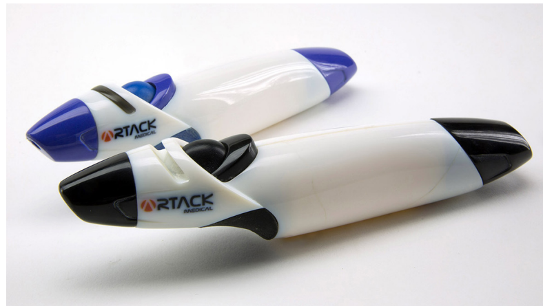
This articulated hernia mesh fixation device prototype was 3D printed complete with logo.