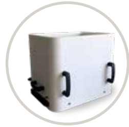
Stratasys H350 build removal box Simple, transportable add what you need