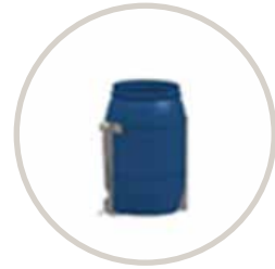
Stratasys H350 powder container Add what you need