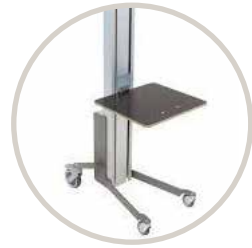
Trolley Easy build box transport