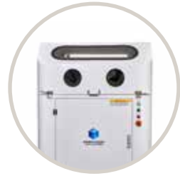
Powder retrieval station Solution for Stratasys H350 printer or your choice