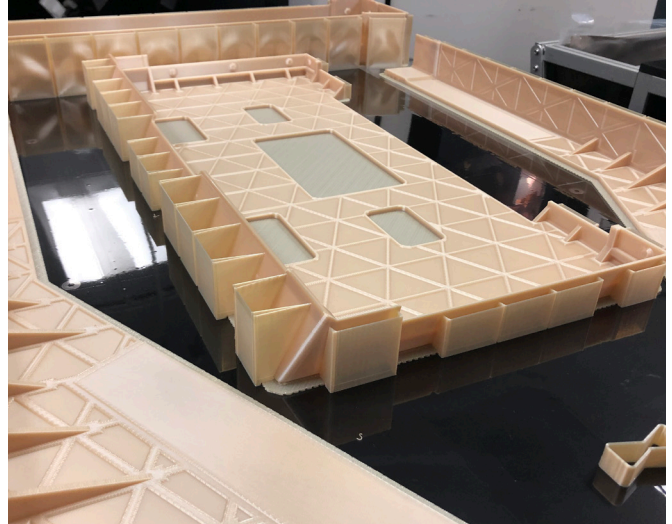
These 3D printed parts replace assemblies that were previously made using a more resource-intensive composite laminate process.