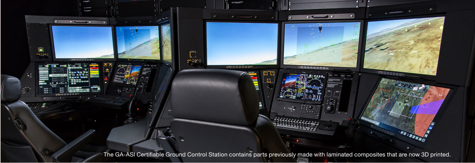
The GA-ASI Certifiable Ground Control Station contains parts previously made with laminated composites that are now 3D printed.

At a higher level, the company has achieved significant cost savings by converting from laminated composite parts to 3D printed alternatives. GA-ASI used AM instead of laminated composites to build elements of its Certifiable Ground Control Station (CGCS), designed for its remotely piloted aircraft systems. Over the initial course of the program, GA-ASI achieved over $2 million in recurring cost reduction in addition to over $300K of tooling savings. A significant portion of these savings resulted from avoided labor to manufacture the tooling and the subsequent lay-up, curing, and final trim work on the composite parts.