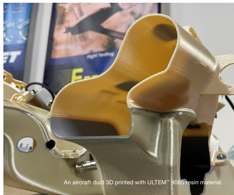
An aircraft duct 3D printed with ULTEM™ 9085 resin material.

That's the reason we go outside for about 75% of our recurring manufacturing, because it allows us to have capacity for the low-volume, one-off, early-stage development work."