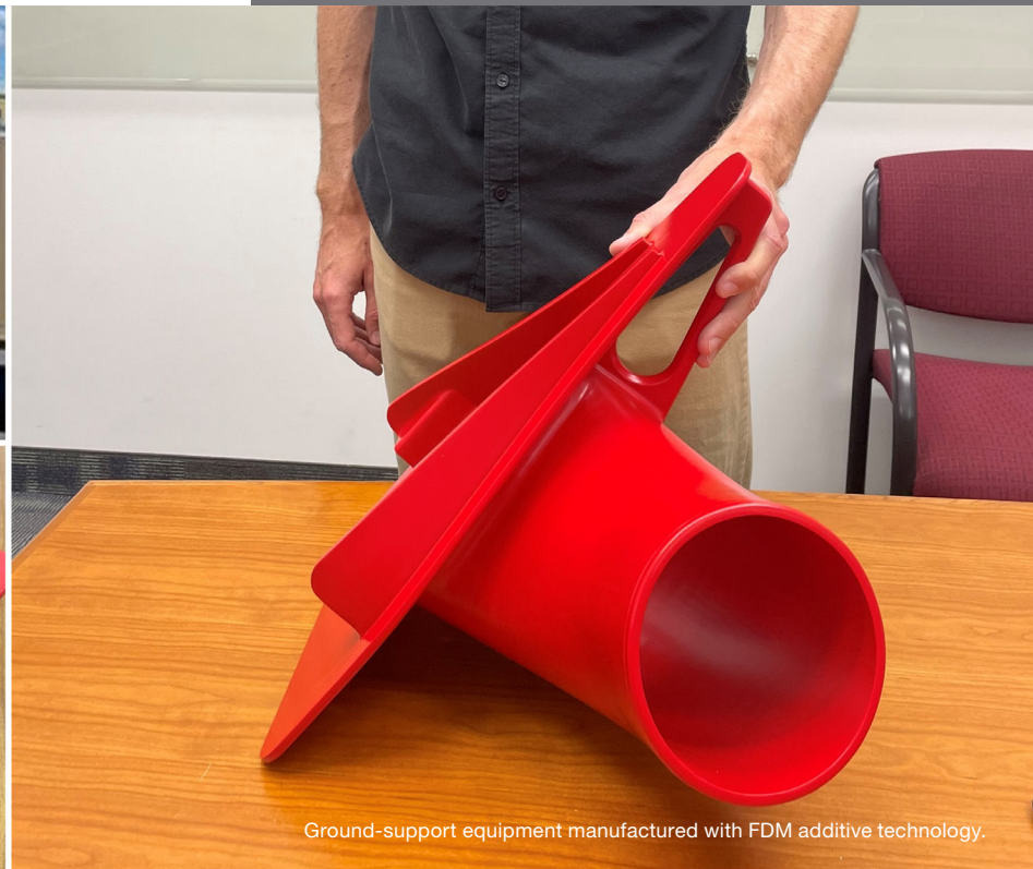
Ground-support equipment manufactured with FDM additive technology.